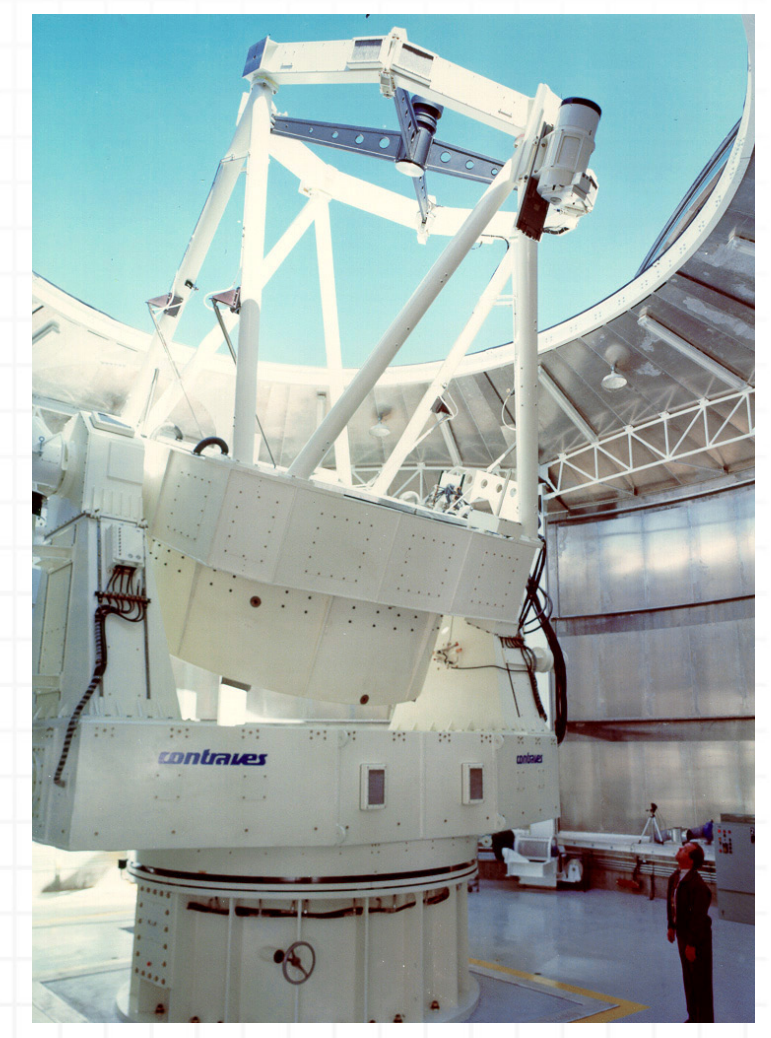
The combined weight of the telescope, gimbals, optics, and support structures exceeds 100 tons. The telescope sits on a massive steelreinforced concrete pier that weighs more than 700 tons. Isolated from the rest of the facility, the pier is anchored in bedrock with long steel rods.

sandwich' primary mirror, this telescope weighs 2,000 kilograms (4,500 pounds) even though its glass face sheet is only 25-millimeter (1-inch) thick. When polished, the mirror surface has a tolerance of 21 nanometers, or 3,000 times thinner than a human hair. The mirror is supported by 56 computer-controlled actuators that allow shaping of the mirror.