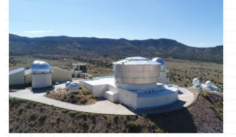
Aerial view of the Starfire Optical Range located on Mt. Fugate on Kirtland Air Force Base, N.M.