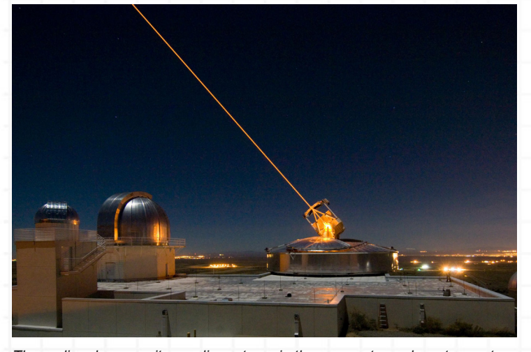
The sodium laser excites sodium atoms in the upper atmosphere to create a source of light or beacon 90 kilometers (55 miles) above the Earth. The adaptive optics system measures distortions of this beacon caused by atmospheric turbulence. The system then sends signals to actuators that alter the shape of a thin mirror thousands of times per second to compensate for atmospheric distortion of the image.

The telescope is located in a cylindrical enclosure that is often compared to a collapsible cup used by campers. This design has two major advantages over conventional domes, which are normally equipped with narrow slits: the enclosure itself does not have to rotate at high speed while satellite tracking and it improves image quality by not trapping warm air that could create optical distortions.