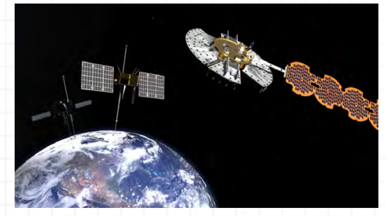
NTS-1, NTS-2, and NTS-3.